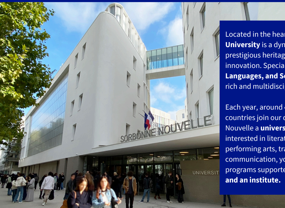
Campus Nation - Main student campus

Located in the heart of Paris, Sorbonne Nouvelle University is a dynamic institution combining the prestigious heritage of the Sorbonne with a spirit of innovation. Specializing in Arts, Humanities, Languages, and Social Sciences , the university offers a rich and multidisciplinary academic experience.