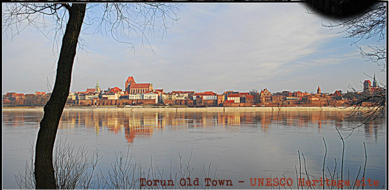
Torun Old Town - UNESCO Heritage site