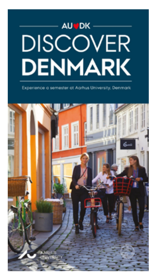
Cover page for a couple of our brochures