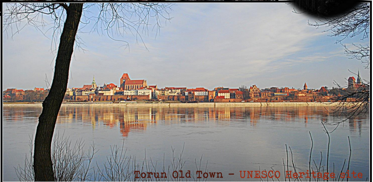
Torun Old Town - UNESCO Heritage site