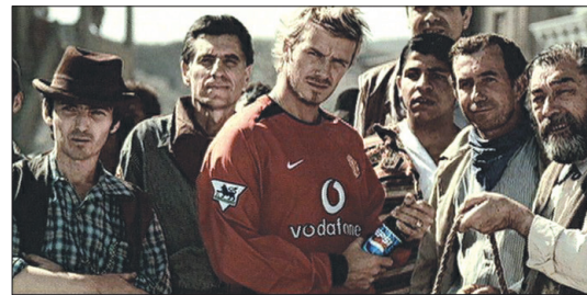
other iconic brands avoid these attributions by becoming committed insiders in the populist worlds from which they speak.