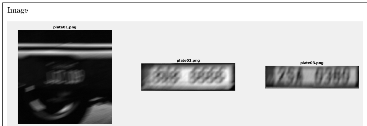
Table 7: Plates of cars