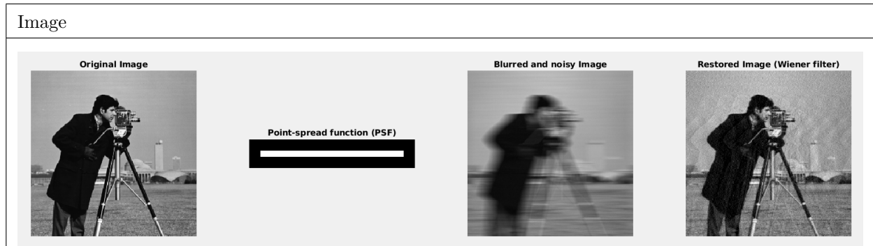
Table 6: Wiener deconvolution