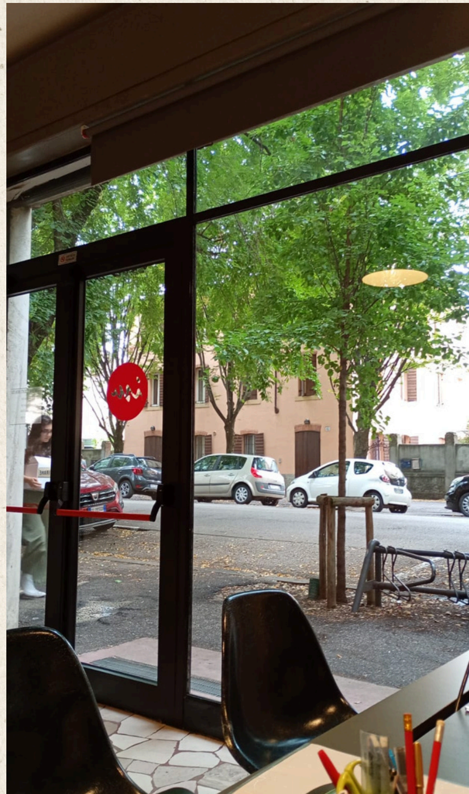
International Welcome Desk

We are an outsourcing company, working under the supervision of the University of Verona since 2001, closely supporting international students during their stay with management consulting and dedicated services.